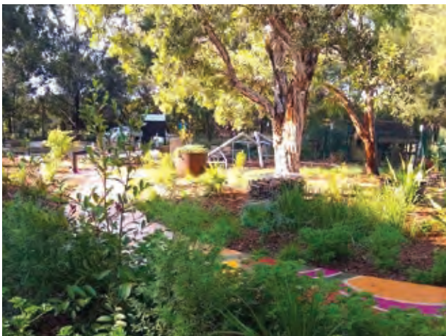
Our 5 Senses Garden, Rhodes Park