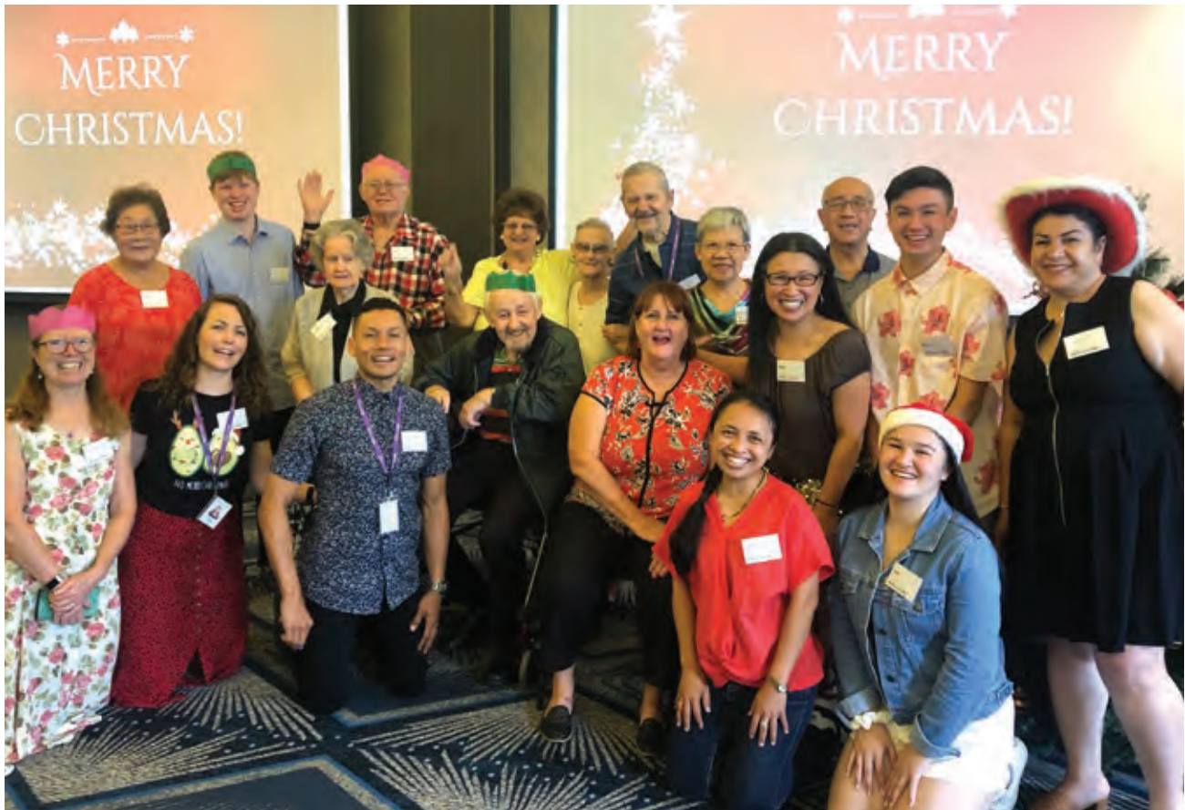
A Very Merry Christmas breakfast